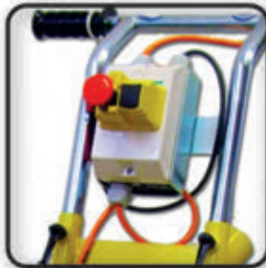
Emergency ON-OFF switch with lanyard