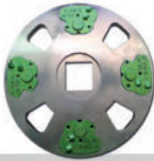
Toolholder with Diamond-Grinding and PCD segments

For difficult removals (Mastic, adhesives, etc.)