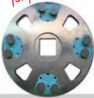
Toolholder with Diamond-Grinding Segments