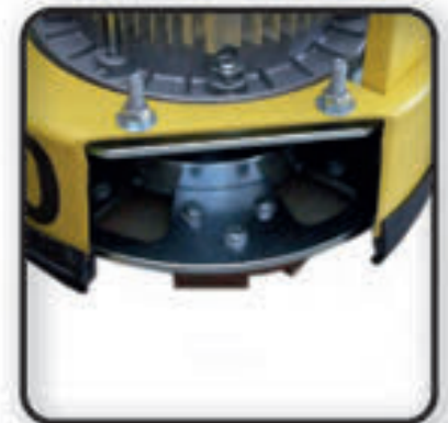
Dust shroud opens for grinding to the exact edge of the wall

Electric version 230 V, for inhouse application, smaller jobs Electric version 400 V, powerful for large areas