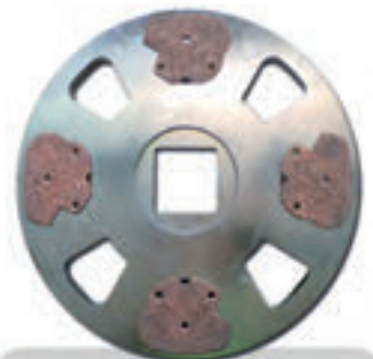
Toolholder with tungsten abrasive coated segments

For difficult removals (Mastic, adhesives, etc.)